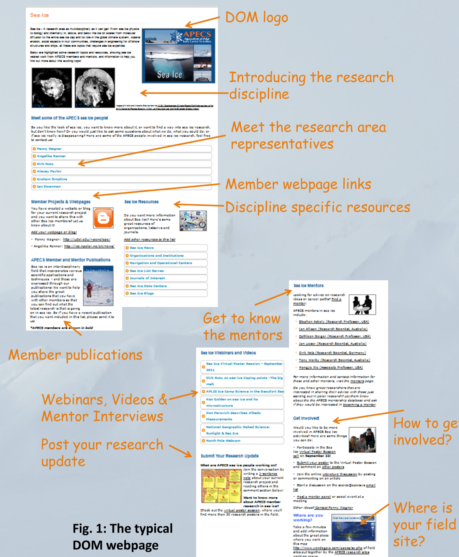
Fig. 1: The typical DOM webpage